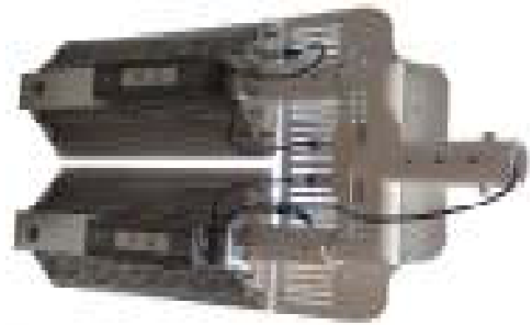
Pole Adaptor Twin Head

Pole Adaptor is designed to fit the existing poles on the road, parking lots, squares etc. The Single Head will fit on the poles larger than 70mm diameter and that will enable to mount the lights with smaller diameter. The Twin Head is mostly used in our Lucas Twin Head Street lights. It has a big contribution when one light is not enough to brighten a certain area and this Twin Head will do the trick to get a wider coverage and higher illumination.